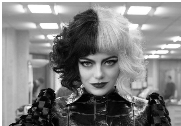
00 G, I